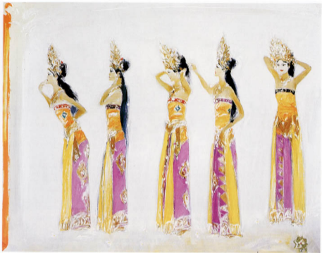
Above: "Becermin Diri", 1997, Oil on canvas, 155 x 200 cm Facing Pages: "Jiwa Legong", 1997, Oil on canvas, 130 x 200 cm