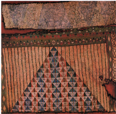
Above: "Wiyang Mahabharata" 1996, Oil on canvas, 135 x 135 cm