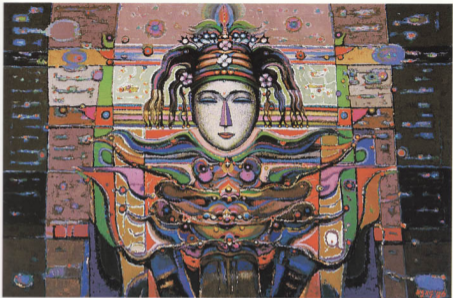
Above: "Dewi Perdamaian", 1997, Acrylic on canvas, 95 x 145 cm Facing Pages: "Wanita Pendekar", 1996, Acrylic on canvas, 95 x 145 cm