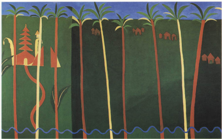
Above: "Ubad Landscape", 1997, Acrylic on canvas, 140 x 230 cm Facing Pages: "The Storm is Not Over Yet... Noah Heard a Whisper", 1997, Acrylic on canvas Triptych, 230 x 420 cm